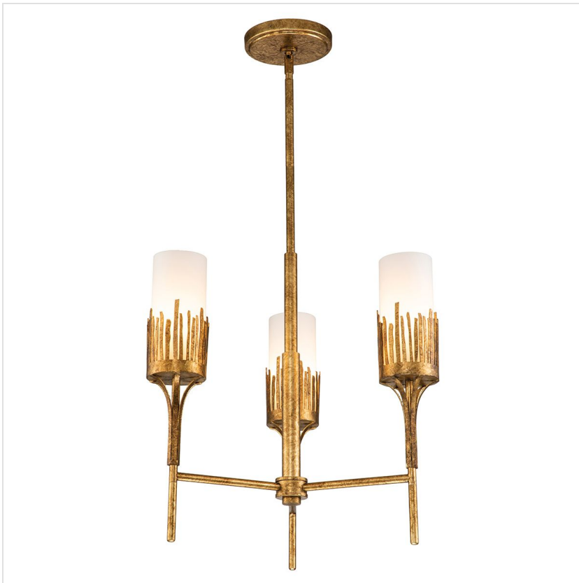
QN-SAWGRASS-3-DG-O Sawgrass 3 Lt Chandelier - Gold Leaf with Antique Glaze