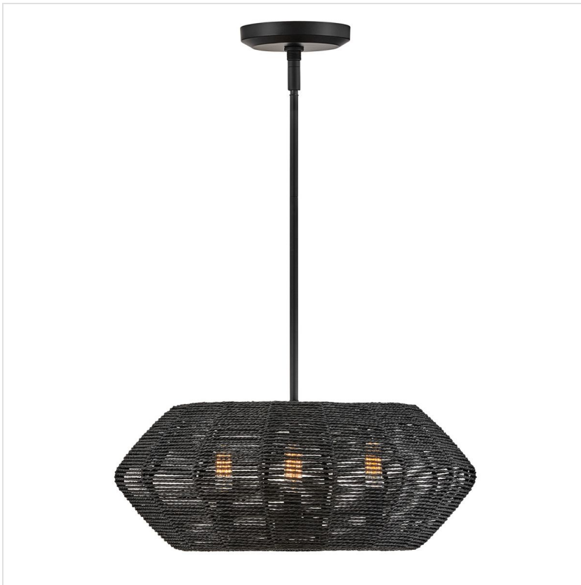
QN-LUCA-P-S-BK-BK Luca 3 It Duo-Mount Pendant - Black