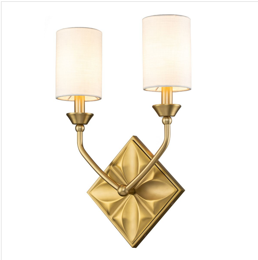
QN-EPSILON-2WB-AB Epsilon 2 Lt Wall Light - Aged Brass