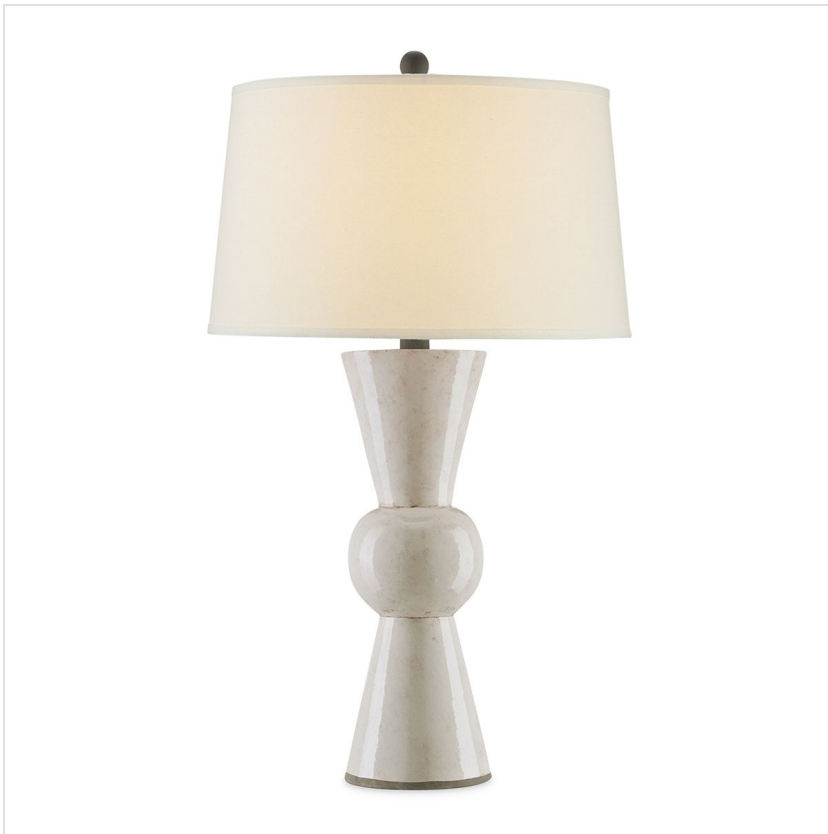
QNC-UPBEAT-TL-WH Upbeat 1 Lt Table Lamp - Antique White