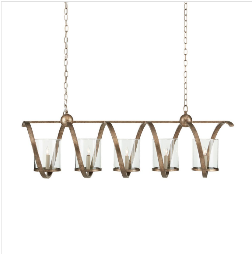
QNC-MAXIMUS-5LP-PYB Maximus 5 Lt Medium Chandelier - Pyrite Bronze / Clear