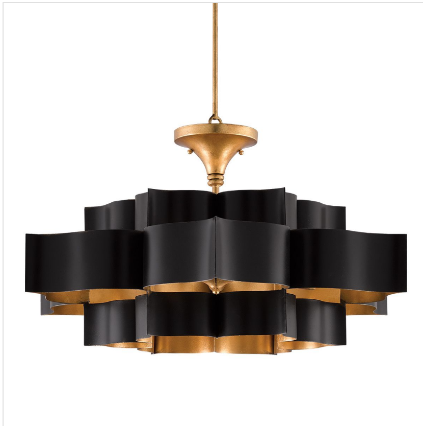
QNC-GRAND-LOTUS-6P-BCGL Grand Lotus 6 Lt Chandelier - Matte Black / Contemporary Gold Leaf