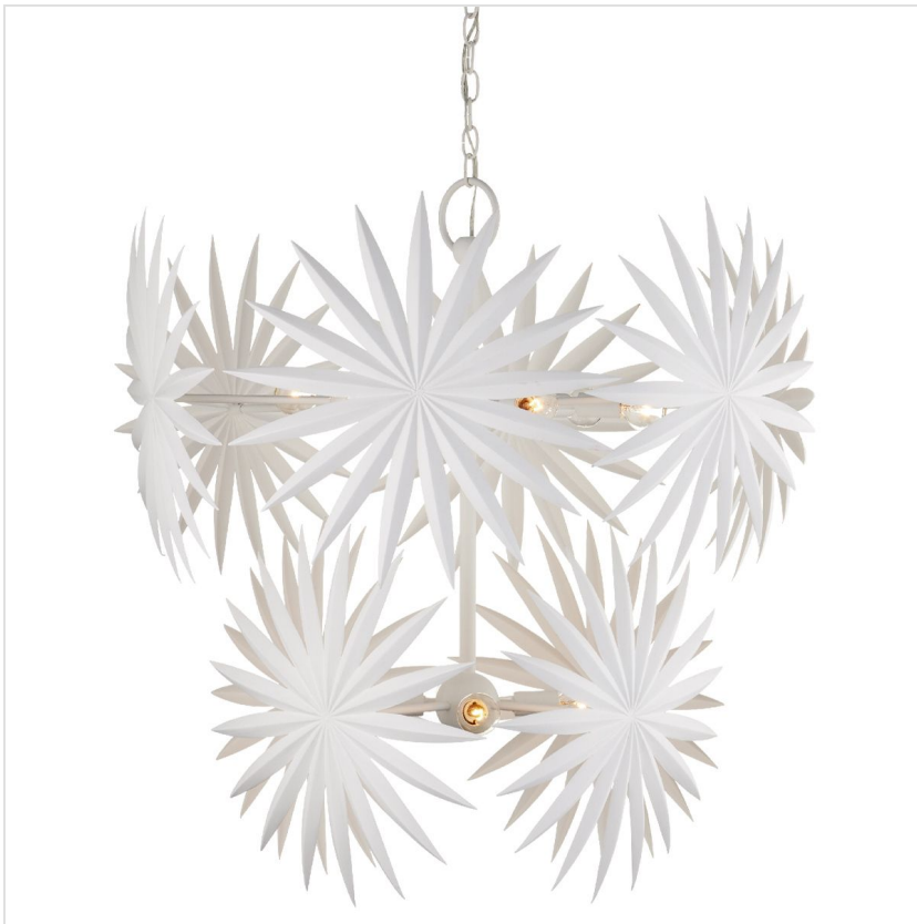
QNC-BISMARKIA-10P-WH Bismarkia 10 Lt Medium Chandelier - Gesso White