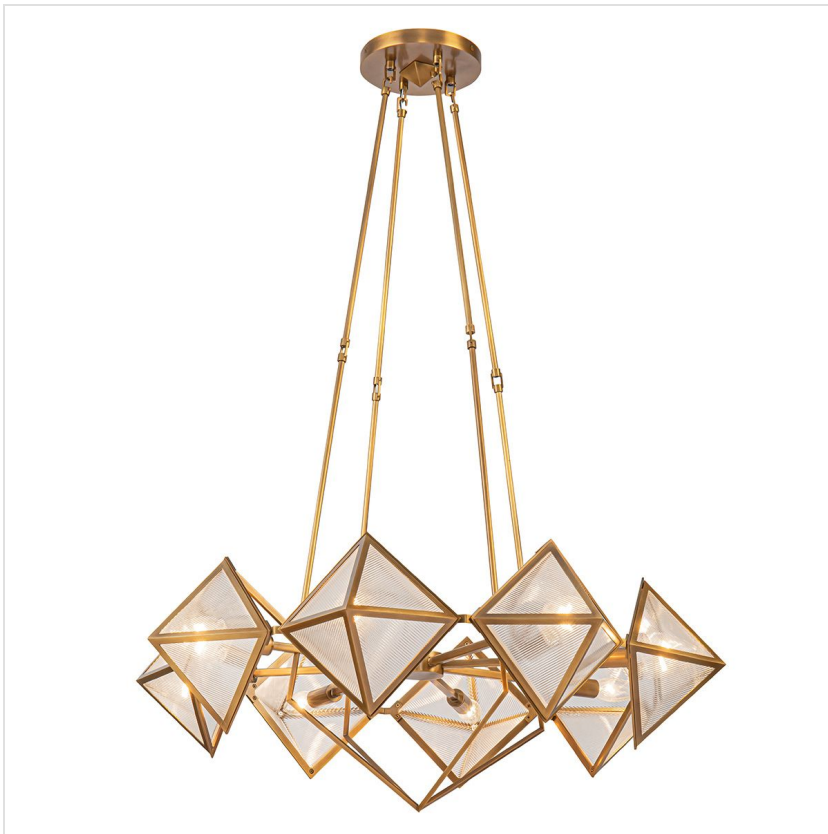
QN-CAIRO8-VBS-CR Cairo 8 Lt Chandelier - Vintage Brass