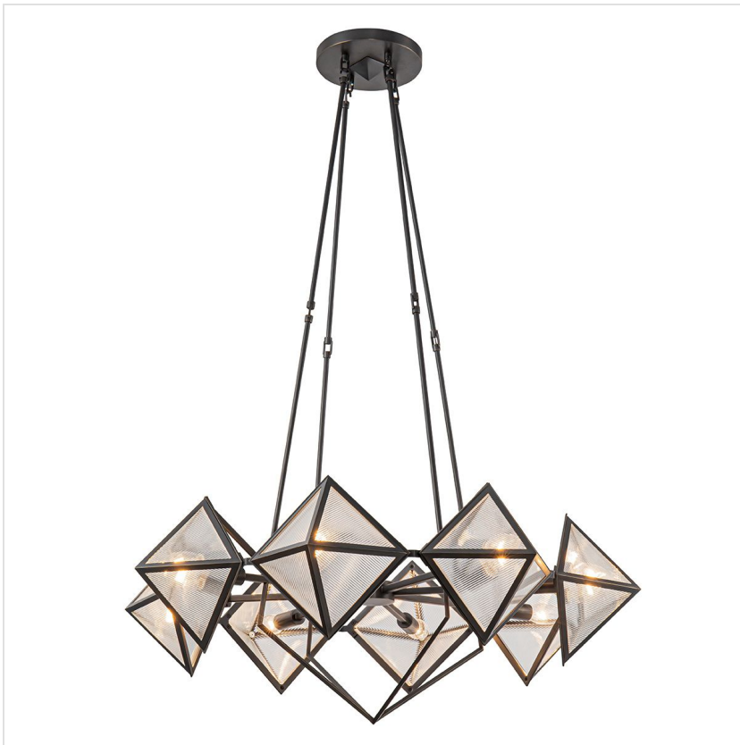
QN-CAIRO8-UBZ-CR Cairo 8 Lt Chandelier - Urban Bronze