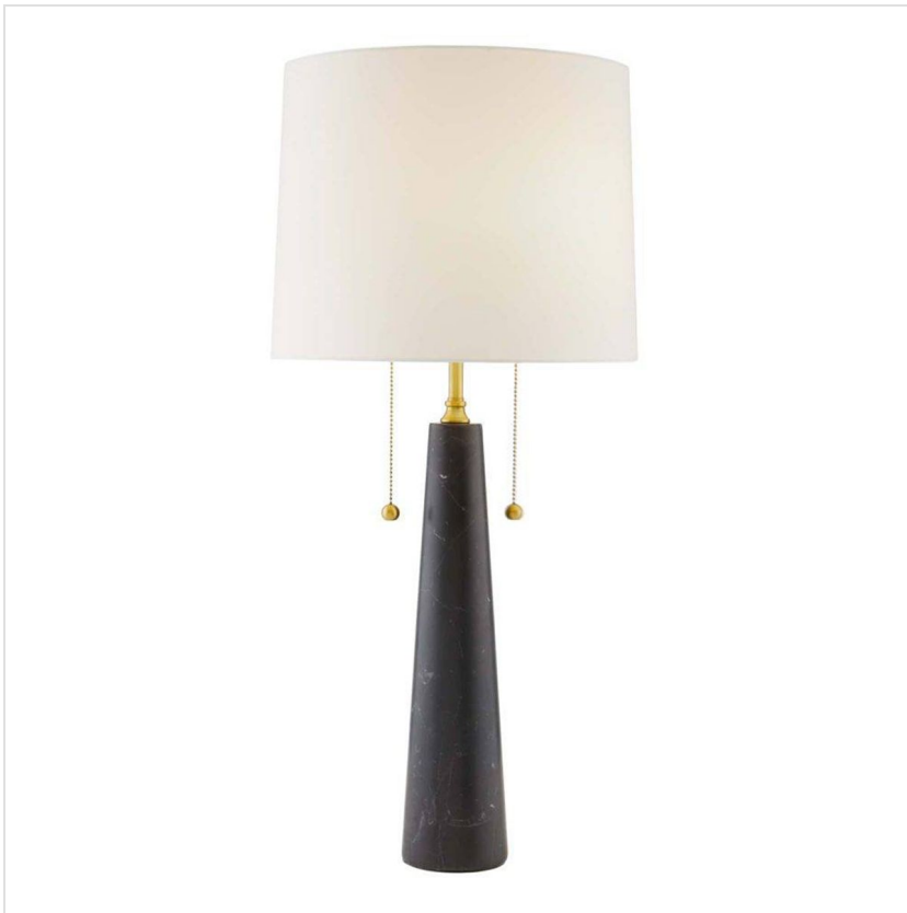
QNA-SIDNEY-TL-BLM Sidney 2 It Table Lamp - Black Marble with Antique Brass