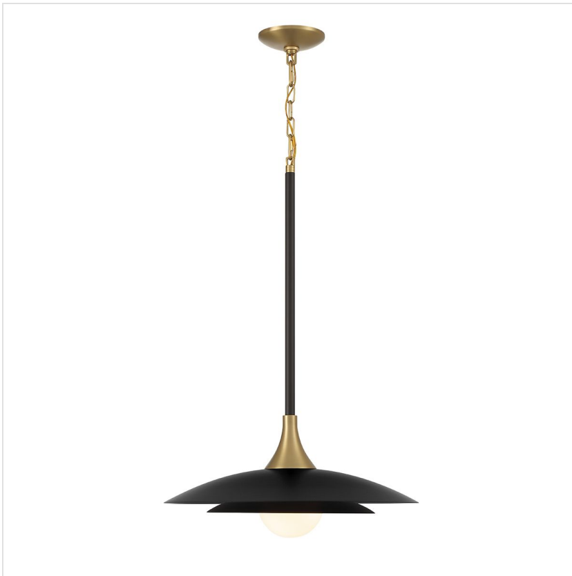
QN-WELSH-P-BK Welsh Pendant Light - Matte Black