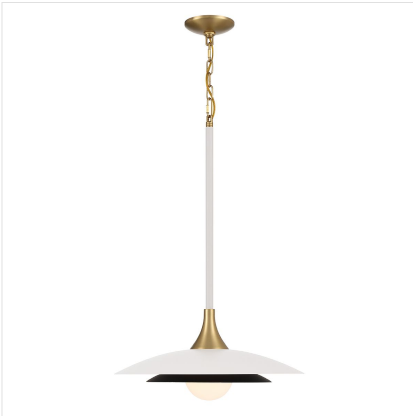
QN-WELSH-P-WHT Welsh Pendant Light - Matte White