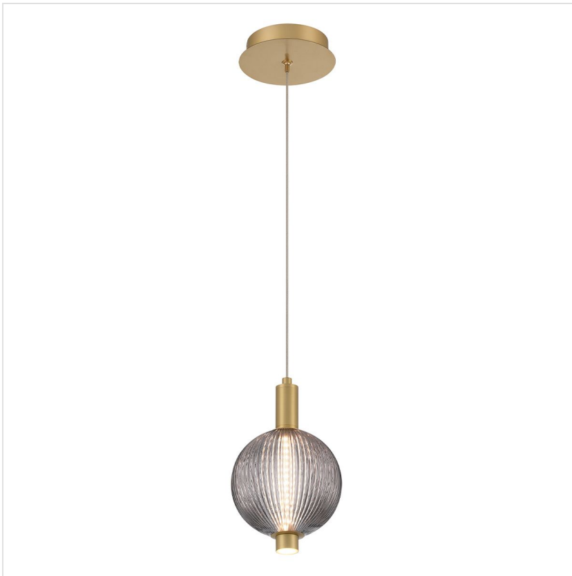
QN-PALMAS-1MP-BG Palmas 1 Lt Mini Pendant - Gold