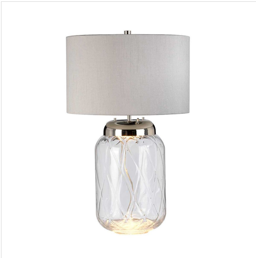
QN-SOLA-TL-L Sola 2 Light Table Lamp - Titanium Shade - Polished Nickel