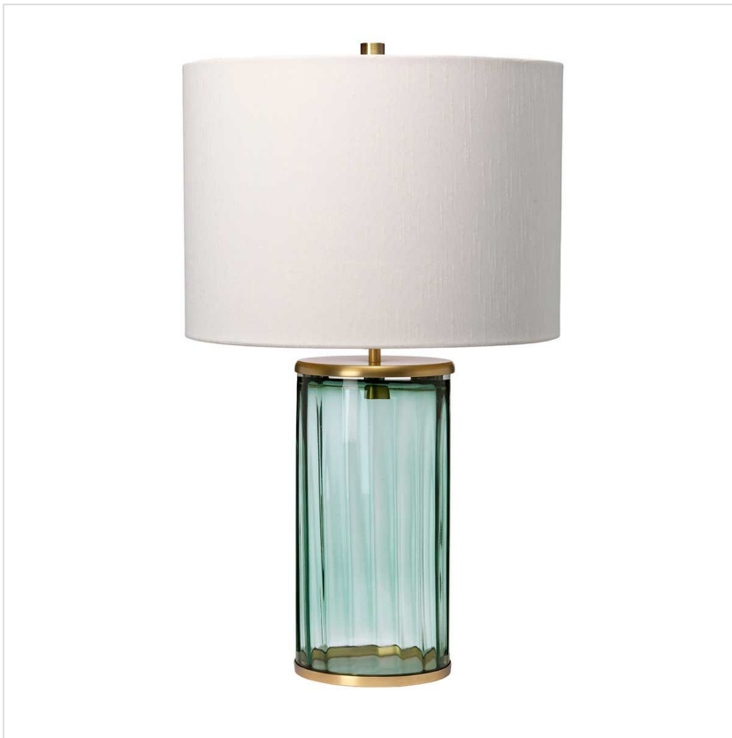
QN-RENO-GREEN-AB Reno Table Lamp - Green - Aged Brass