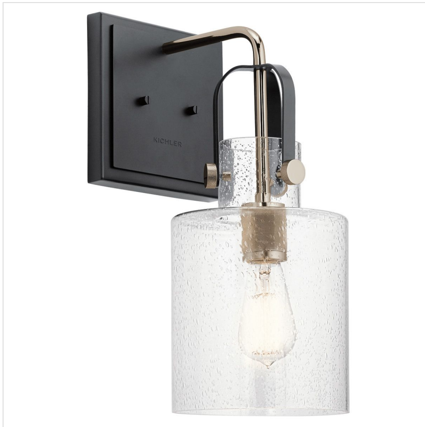
QN-KITNER1-PN Kitner 1 Light Wall Light - Polished Nickel