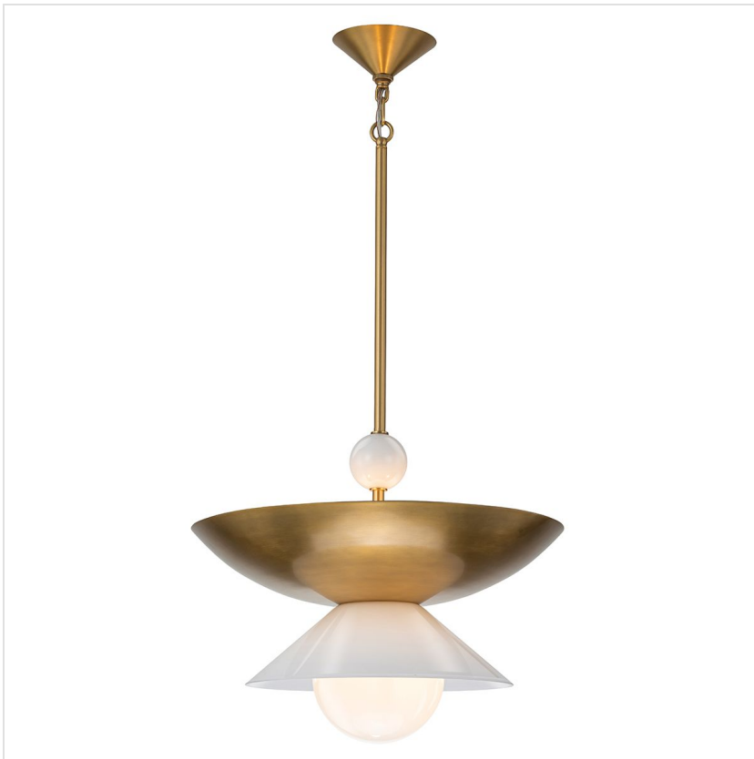
QN-Saucer-4P-L-AB-OPAL Saucer 4 Lt Large Pendant - Aged Brass