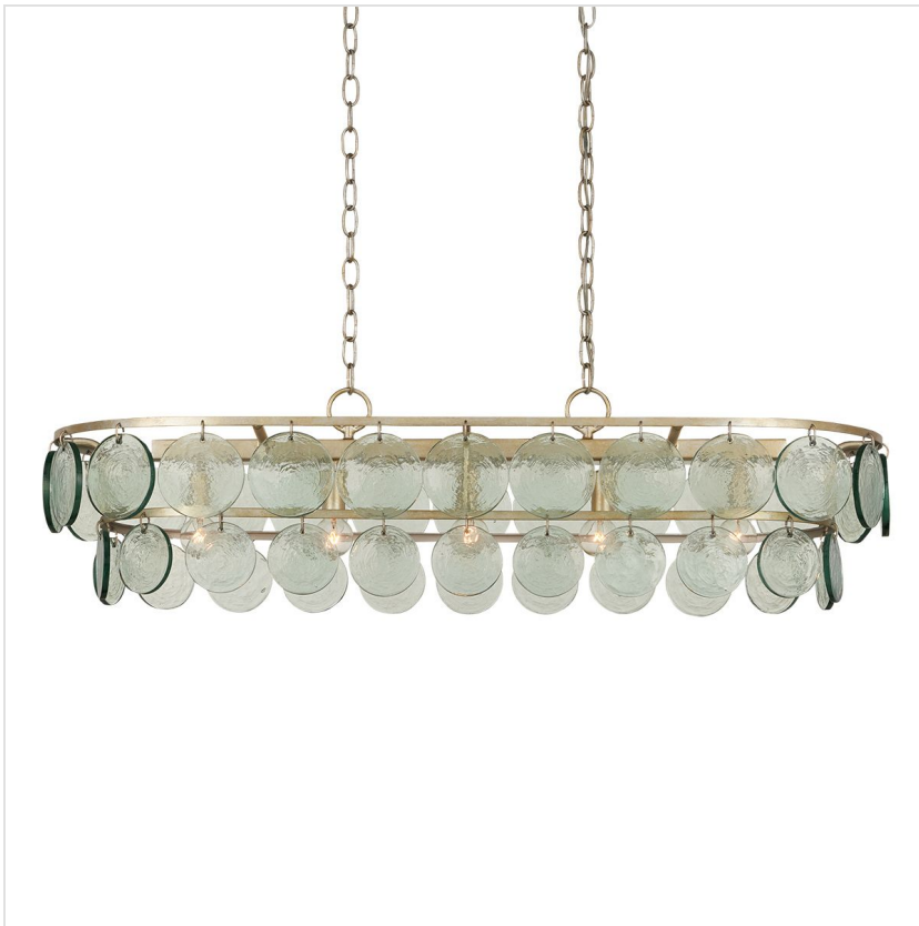
QNC-SETTAT-5LP-SL Settat 5 Lt Chandelier - Silver Leaf