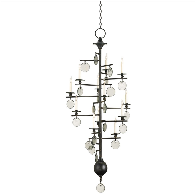
QNC-SETHOS-12P-ABK Sethos 12 It Long Chandelier - Old Iron