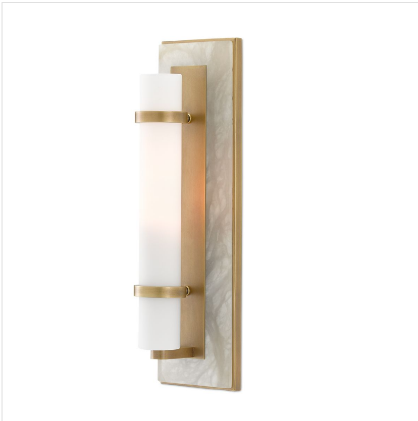
QNC-BRUNEAU-WB-AB Bruneau 1 Lt Wall Light - Natural / White / Antique Brass