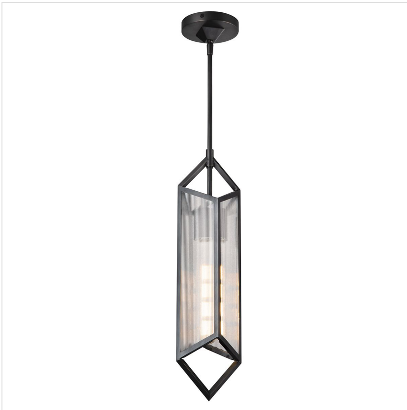
QN-CAIRO-1P-UBZ-CR Cairo 1 Lt Pendant - Urban Bronze