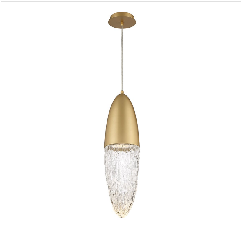
QN-ECROU-1P-BG Ecrou Pendant - Matte Gold