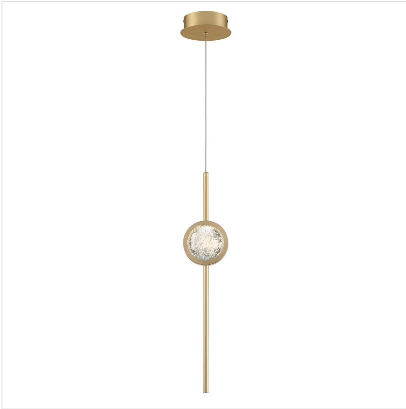
QN-BARLETTA-1P-BG Barletta 1 Lt Pendant - Gold