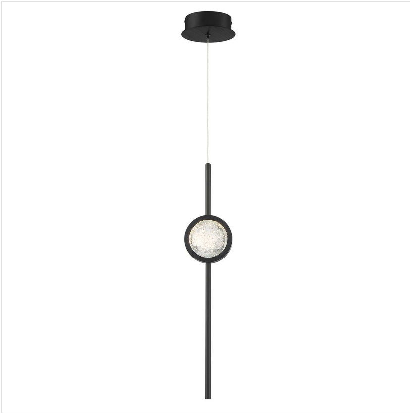
QN-BARLETTA-1P-BK Barletta 1 Lt Pendant - Black