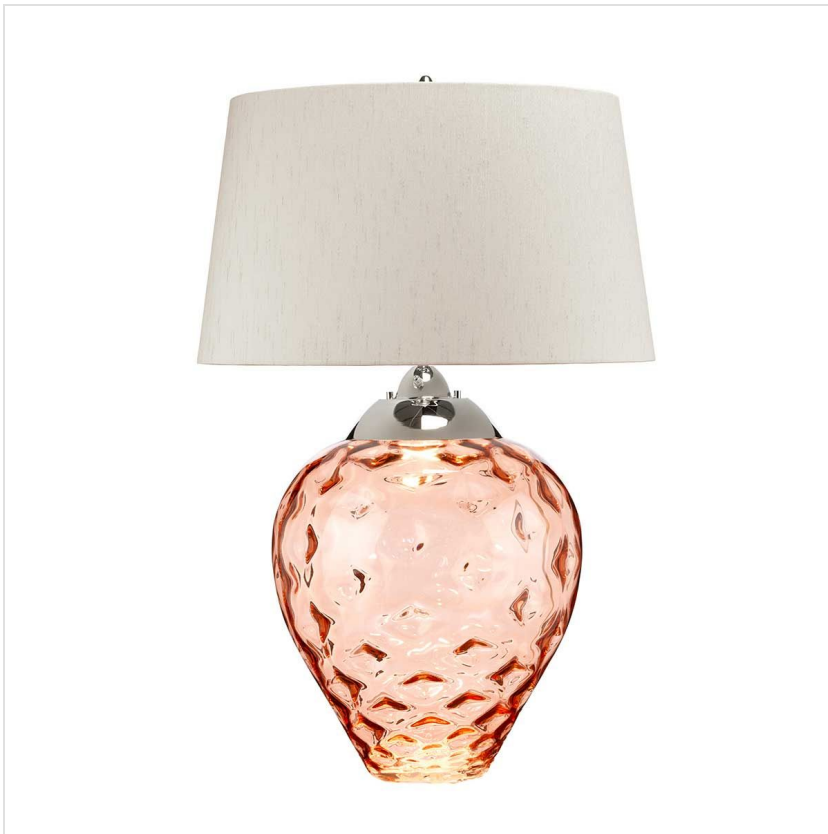
QN-SAMARA-TL-LRG-SLM Samara Large Table Lamp - Salmon - Polished Nickel