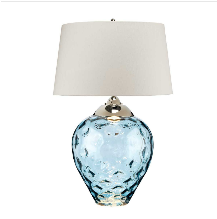
QN-SAMARA-TL-LRG-BLU Samara Large Table Lamp - Light Blue - Polished Nickel