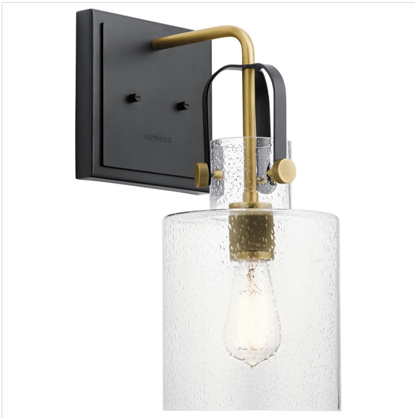
QN-KITNER1-NBR Kitner 1 Light Wall Light - Natural Brass