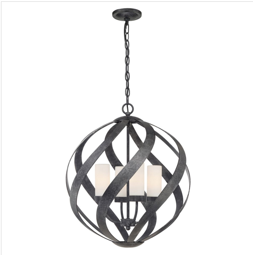
QN-BLACKSMITH-4P-OBK Blacksmith 4 Light Outdoor Chandelier - Old Black