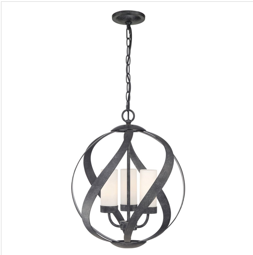
QN-BLACKSMITH-3P-OBK Blacksmith 3 Light Outdoor Chandelier - Old Black